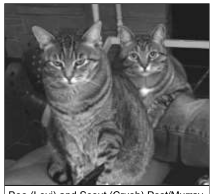
Boo (Levi) and Scout (Crush) Post/Murray Adopted Feb 2013