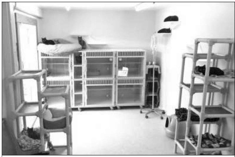
Our new arrivals enjoy the comfort of the cat room while they adjust.

At CASA the staff placed the occupied carriers on the ground in that room and opened the doors. Some