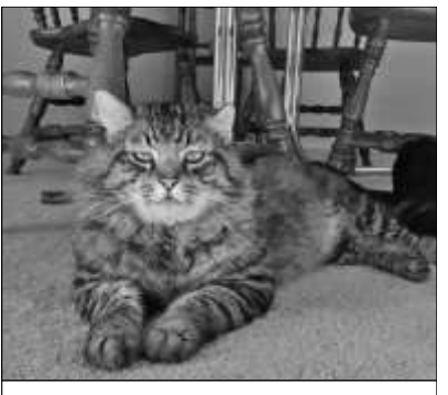
Bogart loves to give big hugs.

Bogart stole my heart when he came to CASA wounded and in poor condition. He really did need a little extra TLC. When I came into the shelter and picked him up he wrapped his little arms around my neck and gave me a hug, he wouldn't let me put him down. At this point I was sold. He is still a big hugger. He spends his days lounging around the house, cuddling, and keeping the dogs in check. I love spending time with the cats at the shelter, but I am so happy to have these pets in my family.