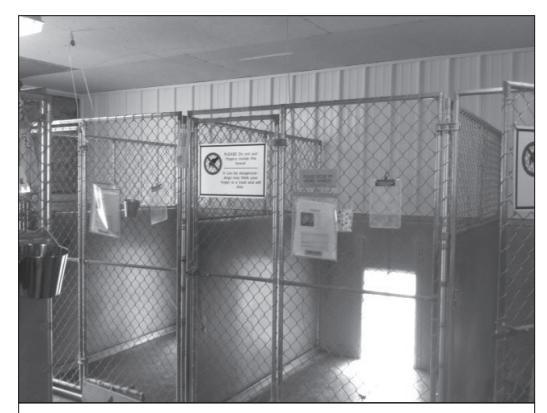
The white vertical sheet metal on the kennel wall is part of the recently completed insulation project.

While the insulation has improved the temperature variation dramatically, the metal walls produce a "surround sound" effect when the