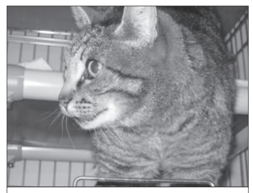
Miss Muffet waiting for her Forever Home.

Continued on page 2 - Older and Wiser and Waiting For You