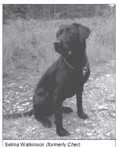
Adopted May 2010