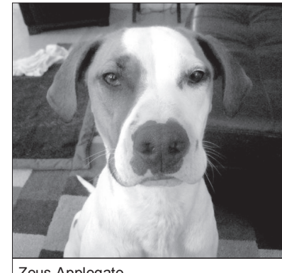
Zeus Applegate Adopted March 2011

Visit <u>camanoanimalshelter.org</u> to view and read about all of our adoptable animals.