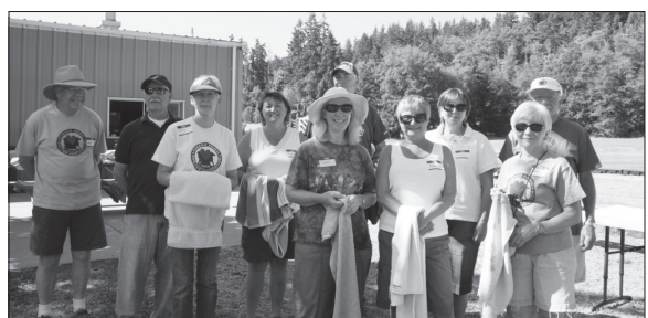
The first shift Drying Team is ready for customers. 69 volunteers and 165 dogs participated in the event.

Big dogs, little dogs, all breeds of dogs came to the 5th Annual Dog Wash. Thanks to the volunteers and CASA supporters, the Dog Wash and associated mailing, earned $4,600 for the shelter.