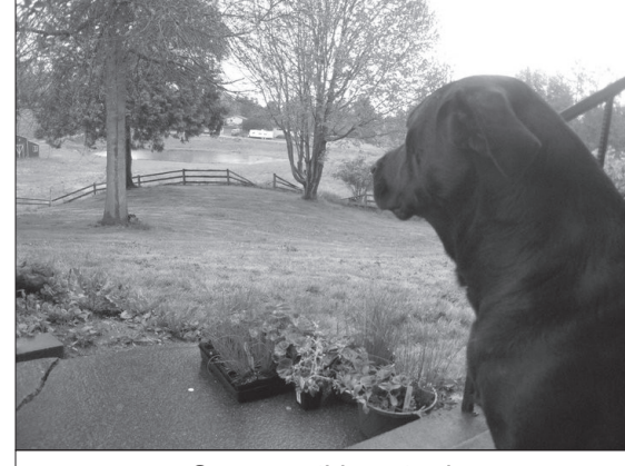
So many things to do ...

to give Hammer a home. After insisting this dog "did no wrong" and that it was a misconception that shelter pets are in a shelter because they