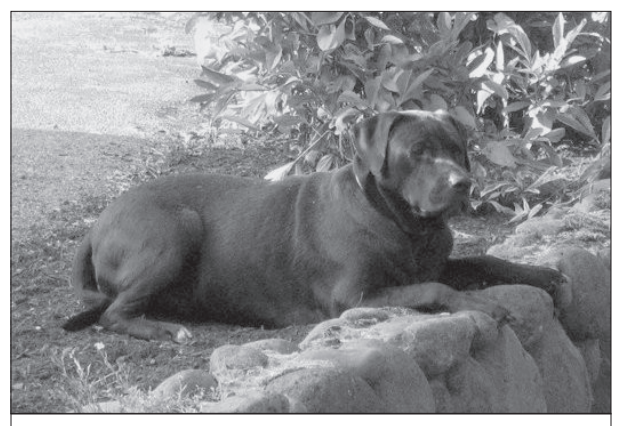
Hammer surveying his domain

Life has changed for Hammer since he found his forever home. Featured as one of the "Invisible Animals" in the Winter 2010 newsletter, Hammer continued to stay in his cage and watch as people passed him by. There just did not seem to be an adopter in sight. When my brother wanted to foster and help a homeless dog for his Senior Project, I knew Hammer was the perfect dog. I admit it was a bit of a setup because I knew my brother and father had been trying to talk my mother into getting another dog. This seemed the perfect way