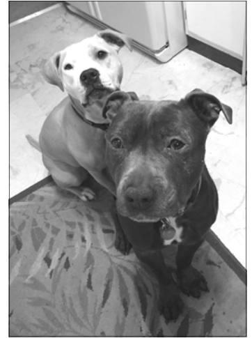
Ramses (front) and Keela

"Pillsbury was badly injured and was operated on at the Everett Animal Shelter. He spent countless days recovering there in the care of the staff and volunteers. Along the way he had visitors from CASA. He has since recovered and is now at CASA. This may have been the first time people actually cared for him."