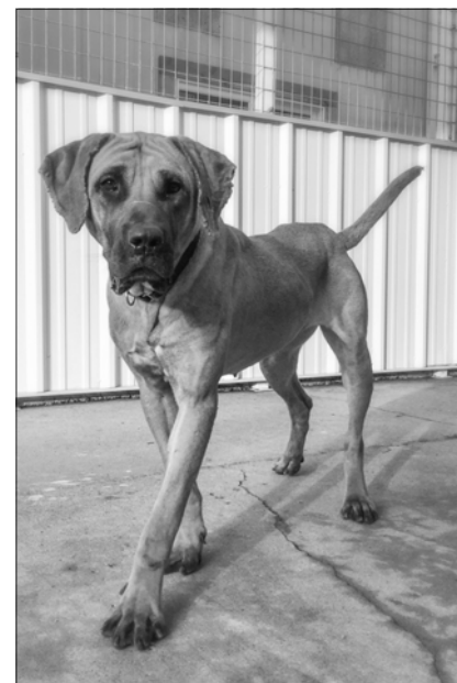
Indira playing at CASA

Indira came to CASA to learn the ins and outs of life as a dog. She was exposed to simple things we take for granted that she had never seen before. She made a few dog friends and being with other dogs really brought out her playful puppy-like personality. While she tolerates people, she does not quite understand the bond we take for granted and does not go out of her way to seek affection. Indira's journey in terms of rescue and travel is completed. She has since been adopted by people who understand that Indira's journey is not yet over.