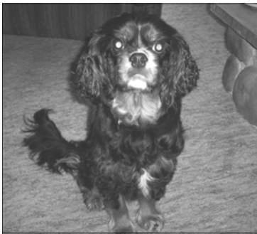
Ozzie loves his walks.