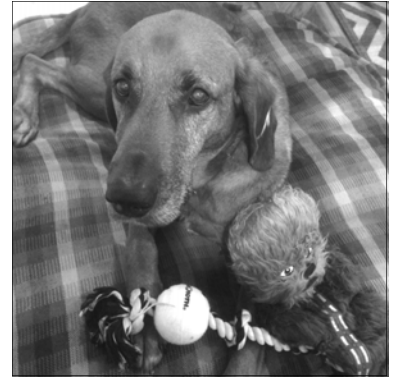
Big Mac and his toys