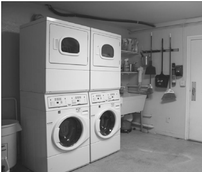
Quiet commercial units meet laundry challenge.

We take in over 500 animals each year and have used a very outdated and inefficient laundry area for many years. The "Laundry Room" is home to not only laundry, but also our only refrigerator, overflow cat kennels, linen/supply storage, shelter cleaning supplies, travel crates, utility sink for this room and isolation room, microwave, very small table-top cabinet for cups and staff snacks. Sometimes we have to bring in an x-pen for shy dogs who are too scared for the dog kennel area. This room is only 142.5 square feet in total and is absolutely the nucleus of our shelter.