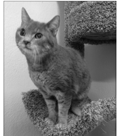
Callie would love a foster home.

We are hoping to recruit new foster families who would be willing to temporarily open their hearts and homes to an adult cat who is in need of medical care and/or recovery time. Think you don't have the space or time to foster? Even the smallest bedroom, office or bathroom is larger and will provide more comfort than a cage at our shelter. These cats don't need much entertainment and will appreciate a quiet place to relax until they are feeling better. While some cats require weeks or months of fostering, many only need a short stay outside of our shelter.