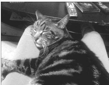
Beau loves his new home.

I was on the hunt for a second cat: one who might keep my 8-year old Phoebe company, and one who would be a lap cat (alas, my darling Phoebe is not). I walked into CASA and told the two staff members what I was looking for. They looked at each other and both immediately said "Beau!" Sure enough, I took Beau home with me. Three months later, he is a total cuddlebug, a chatty Charlie, and exactly what I was looking for in a second kitty. (I'm still working on getting Phoebe to play with him, but for the most part she tolerates him!)