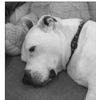
Blanca Thompson Adopted Dec 2014