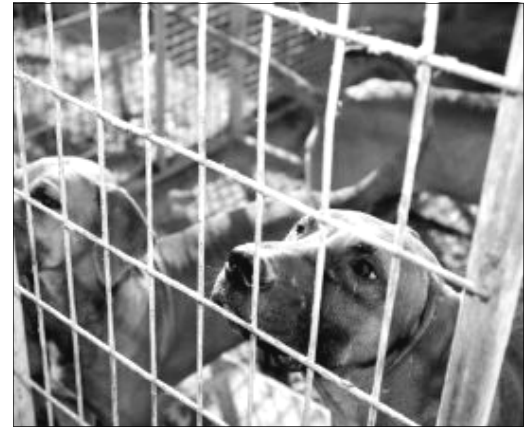
Dogs in cages at South Korean farm

HSI is working in countries across Asia to end the grisly dog meat trade. More than 2 million dogs are bred and butchered each year for their meat in South Korea, part of Asia's cruel dog meat trade. In China and elsewhere, most dogs are stolen from the streets, but in South Korea, they are exclusively bred on small-scale factory farms.