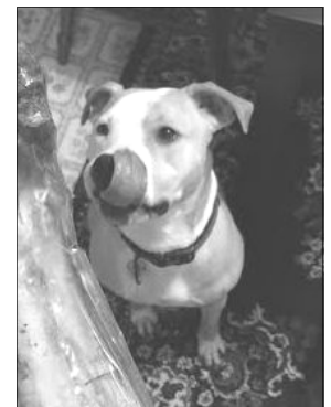
That bone looks good!