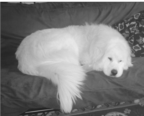
Nabi finally found her Forever Home.

When we went to CASA we had one dog in mind, but another family adopted him. We looked around saw this puppy, but after hearing how this little boy lost his dog, we decided he needed the puppy. The whole time this white polar bear looking dog, Nevasca, was eyeing us and we decided to see if she was a fit with our two dogs.