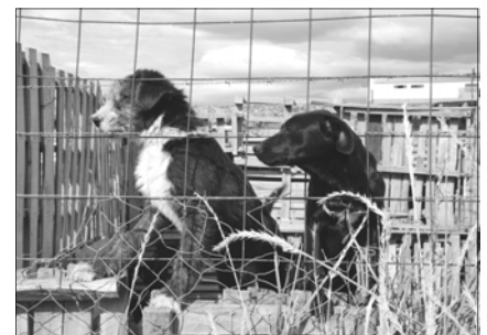
Watching for visitors.