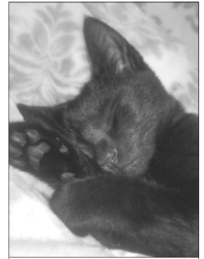
Shiba loves to talk.

The black kitten is Shiba, She is such a sweetheart and loves to talk. She will meow if you ask her a question and she'll have a conversation with you. I love her so much, every night she sleeps on the right side of me tucked into my arm or under the blankets. Every time I come home she comes darting past me and into my room to say hello and wanting a hug and pets. One thing that Shiba is really good at is stealing items and stashing them under my bed. So far I've found, socks, papers, a clean diaper (I have a baby sister), all of her cat toys and a few water bottles. but I still love her. The tortoiseshell is Muffin. She doesn't talk as much as Shiba but she loves pets and kisses. She'll often meow a whisper and paw at your arm wanting to be petted. If you pucker your lips to her, she'll reach up and give you a kiss. She loves the laser pointer we have and will chase it any time of the day. She will sleep on the left side of me also in my arm.