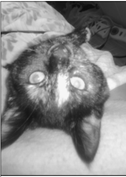
Muffin loves to play.

The black kitten is Shiba, She is such a sweetheart and loves to talk. She will meow if you ask her a question and she'll have a conversation with you. I love her so much, every night she sleeps on the right side of me tucked into my arm or under the blankets. Every time I come home she comes darting past me and into my room to say hello and wanting a hug and pets. One thing that Shiba is really good at is stealing items and stashing them under my bed. So far I've found, socks, papers, a clean diaper (I have a baby sister), all of her cat toys and a few water bottles. but I still love her. The tortoiseshell is Muffin. She doesn't talk as much as Shiba but she loves pets and kisses. She'll often meow a whisper and paw at your arm wanting to be petted. If you pucker your lips to her, she'll reach up and give you a kiss. She loves the laser pointer we have and will chase it any time of the day. She will sleep on the left side of me also in my arm.