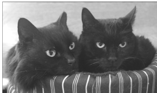
Hubby, age 10 and Wifey, age 11 came to CASA in February and are still waiting for you to adopt them.

But there is something about a senior cat that is compelling. Scared, bewildered and sometimes pathetic looking, these pets were once cherished members of someone's family. To be in a home environment one day and at a shelter with many other cats the next day is terrifying for older animals. We cannot explain to them that their person died or the baby is allergic or their family moved to no-pets housing. We do not always know their history if they