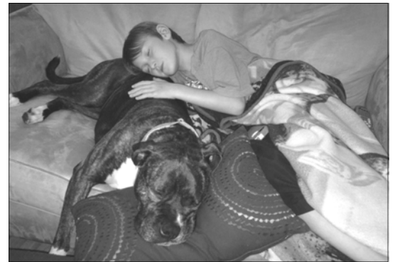
Missy and her best friend in the whole world.

Missy was rescued by the kind people at CASA from another shelter. We cannot express how grateful we are that CASA staff had the good sense to see past her supposed issues and to save her. It turns out that while easily spooked and very protective of her people, she is far from vicious. She is a silly, wiggle butt who sometimes doesn't know her own strength or energy and has been known to flail around in excitement causing injury to the unsuspecting bystander. It is clear that in her former home she was misunderstood and perhaps mistreated as a result, but with some gentle care and consistent training, she is coming along very nicely. Transition from country dog to city dog still causes a bit of fear for her, as there are so many more loud noises and people around to protect us from.