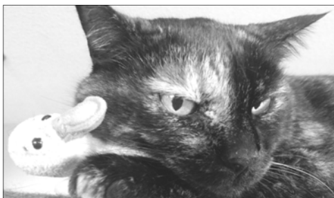
Ducky Mezzone Adopted Dec 2003