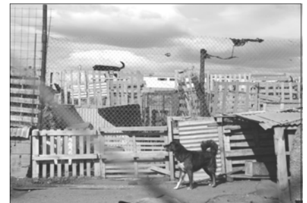
A place to stay while they wait.

While the physical structure was very different from CASA, as we talked with the volunteers, it became apparent that the common tie was love and concern for animals and the desire to find homes for them. To learn more about TAMA, visit their website at www.tamacalafate.org and their Facebook page, www.facebook.com/tama.elcalafate . It is in Spanish, but "pictures speak 1,000 words", and so does the love of animals.