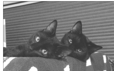
Tilford and Templeton Challenger Adopted Nov 2013